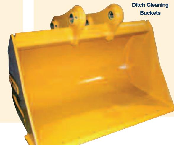
Ditch Cleaning Buckets