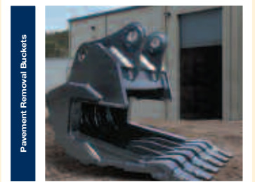
Pavement Removal Buckets